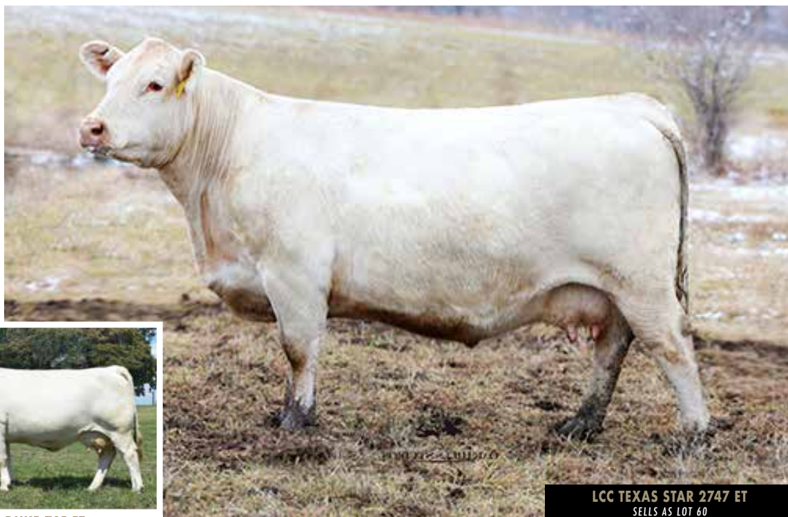
RE MS DUKE 745 ET DAM OF LOT 60