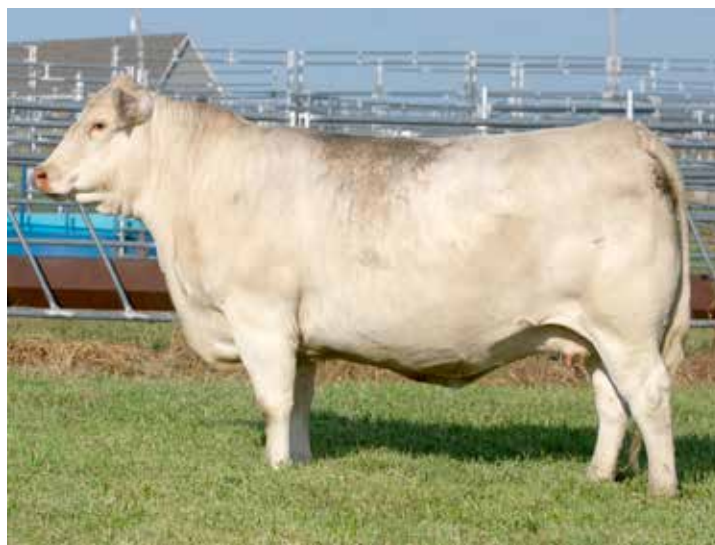
FINK MISS 7982 1162 FL DONOR DAM OF LOT 92 EMBRYO