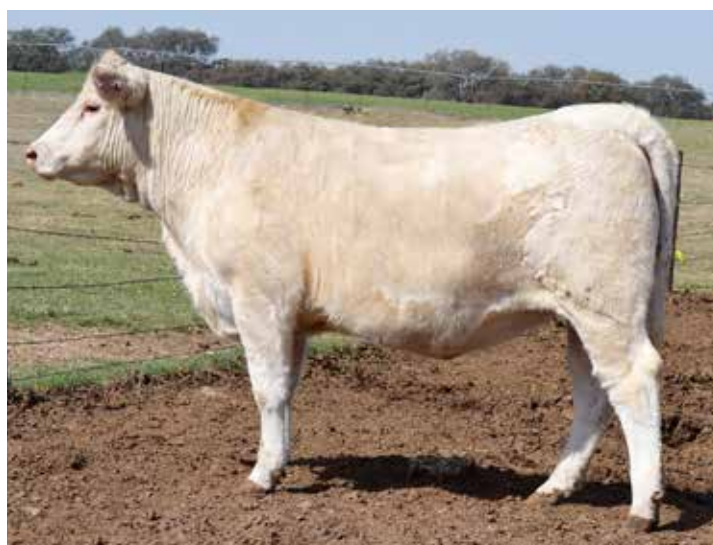
BARA 23Z REAL SUGAR 27J P SELLS AS LOT 13