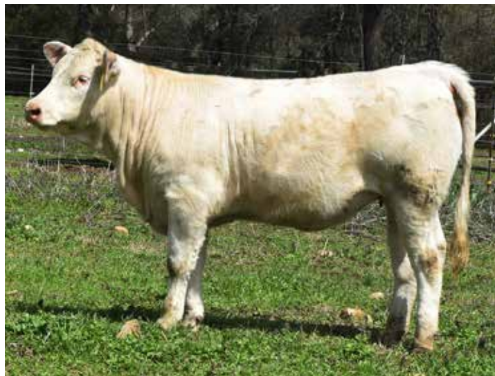
HF TOK K151B TW SELLS AS LOT 49