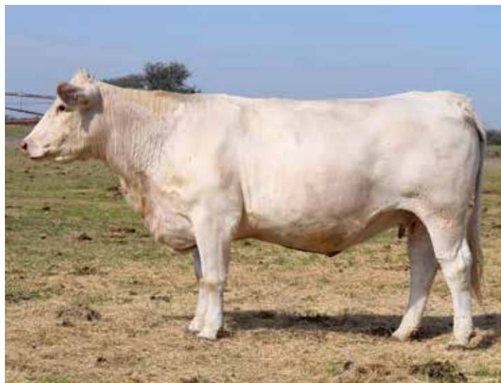
CWC LAURA 717 SELLS AS LOT 18