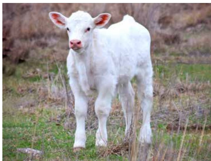
RE JUBALATION 303 P ET SELLS AS LOT 22