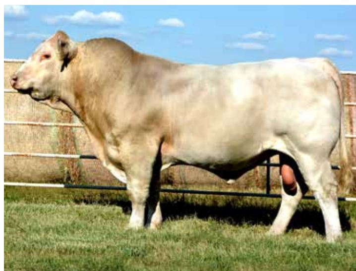
BHD ASSET B178 P SIRE OF SIRE OF LOT 95