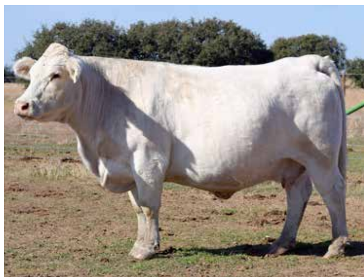
RE CIGAR GIRLS 116 ET DAM OF LOT 28