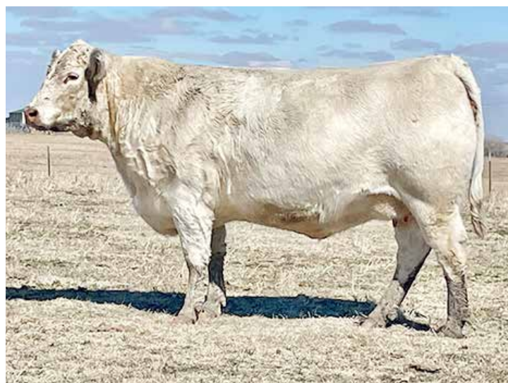
LCC MISS LADY 982 OF 6868 FL EF1286448 TOP 1% MARB, 2% SC, UDDER, 4% TEAT, 5% CW AND 25% TSI FOR EPDS (PAF)