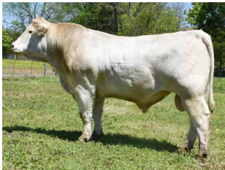
DC/BHD KING F2503 P SIRE OF LOT 44