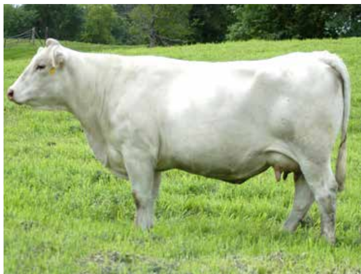
D&D MS CLARICE 2809 PLD ET MATERNAL GRANDAM OF LOT 5

5A: Pld Heifer, 3L, born 3/5/23, bw 73, sired by JBC Smokester 816. 816 has done a super job, thick, stout calves with tremendous growth and muscling for lots of eye-appeal! Semen will be furnished for Rooster, Jubal, or our new acquisition from the 2023 DeBruycker Bull sale, DC/BHD Zegasus K356, a paternal sib to the high selling $60,000 purchased by Lindskov's LT Ranch. We also own an interest in his Maternal grandam, BHD Ms Cobalt Z767!