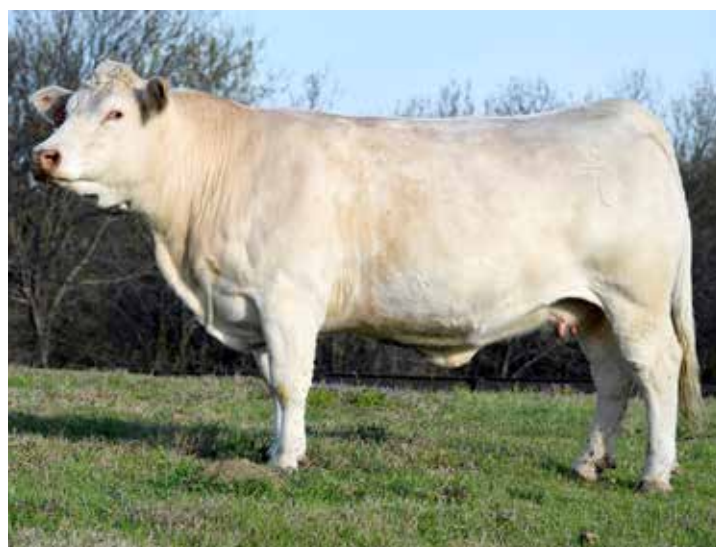
JDJ MS TRUEMARK Y322 DONOR DAM OF LOT 85 EMBRYOS

Selling 3-Sexed IVF Female Embryos from mating of DC/CRJ Tank E108 P (PAF) x JDJ Ms True Mark Y322 Est EPDs. Females from this mating should be awesome brood cows that will enhance any herd. There are so many generations behind this pedigree of constant improvement and taking the guess work out. And this is based on practical beef qualifications, not fads, or non-industry beef standards.