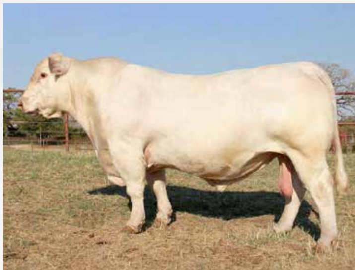
M6 NEW STANDARD 842 P ET HIS SERVICE SELLS AS LOT 57