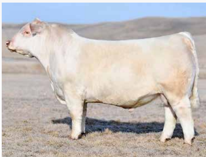
TR CC DELIVERANCE 7974 PLD ET HIS SERVICE SELLS AS LOT 58

Selling 3-units of M6 New Standard 842 P ET semen. Semen is located at KABSU in Manhattan, KS. New Standard has set many records in the breed. With 539 daughters in production and 1458 registrations from 147 herds. He still ranks in the top 20% WW, 15% YW, 20% MTL, 3% CW, 7% REA, 8% Marb, and 7% TSI in the breed.