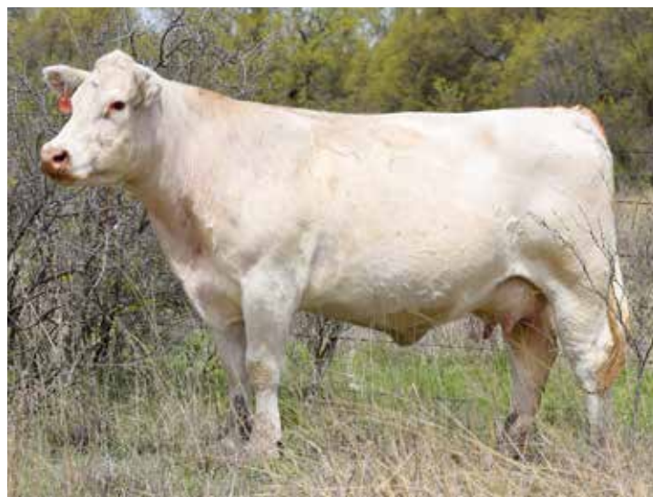
JDJ MS CIGAR B2011 P ET DAM OF LOT 9

Sells bred A-I on 1/6/23 to DC/CRJ Tank E108 P, PE from 3/1/23 to RE Kingman 134 ET to sale. The productivity of B2011 is remarkable, she has over 53 calves registered to her. This massive heifer displays the ultimate in femininity yet abundant performance. Her depth of body and spring of rib, big square hip, and extended spine reflect the best of her sire and dam! Line-bred to Cigar 3 times and still PAF!! One of the real good ones!