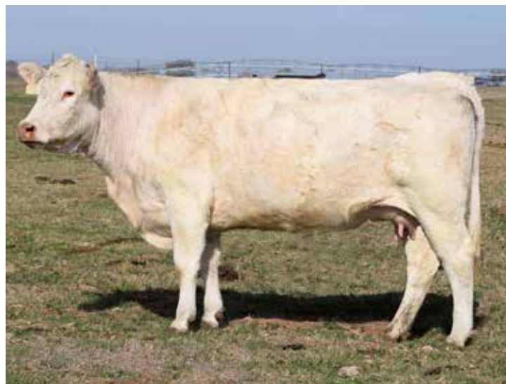
BARA DIAMOND MAX 71F P SELLS AS LOT 3