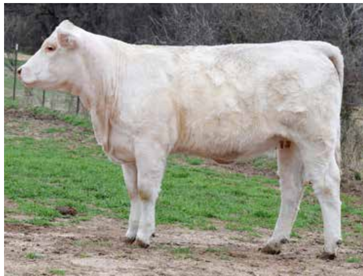
BARA MS 303 CIGAR 38J ET P SELLS AS LOT 24

Sells Open, with breeding privileges to Jubal or our newest herd sire addition, DC/BHD Zegasus K356, M982527, purchased in the 2023 DeBruycker Sale. This heifer has a little more frame than some Cigar's and displays superb femininity with a quality appearance of equal spacing and correct udder development! Bella Angel has two full sibs and they are awesome as well. With the background this heifer could be a future donor!