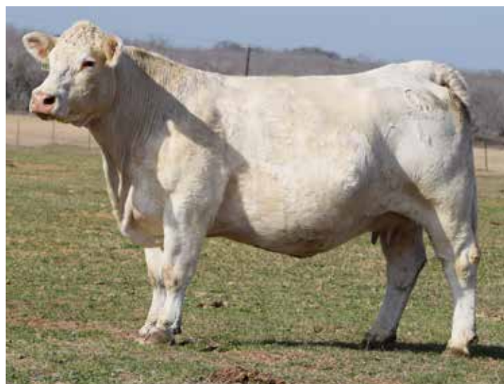
JDJ MS LEDGER C3228 PET DONOR DAM AND FULL SIB TO JDJ MAXIMO A18 P