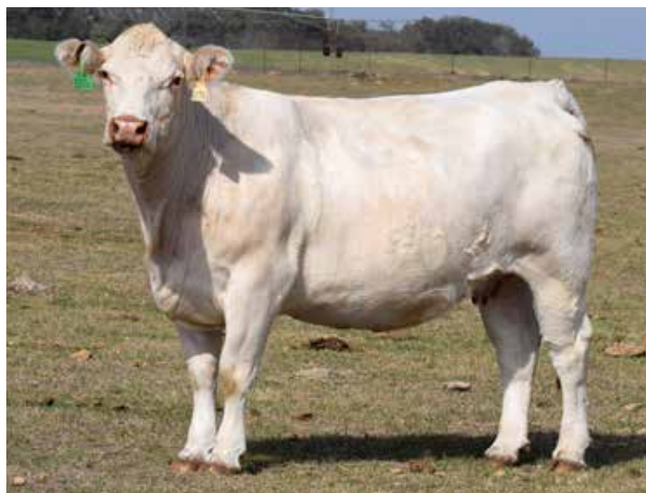
LWF MS ZEN 1175 SELLS AS LOT 17

Implanted with embryo 2/3/23 from mating JMAR Jubal SPO1 x OHF Lady Oaks B226 (see lot 10). What an exciting opportunity to obtain genetics from one of the best young sires in the breed and a great proven donor! Jubal ranks in the top 15% for WW, 3% YW, 15% MTL, 6% CW, 6% Marb, and 2% TSI. Ms Zen is equally impressive with her stature, correctness, and ability to raise big stout calves!