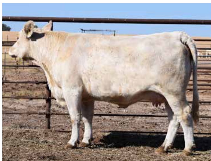
BARA Y322 LADY BRAXTON 57G ET P SELLS AS LOT 20