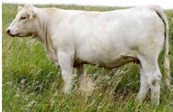
RCR MS GRID SQUAW J800 SELLS AS LOT 94