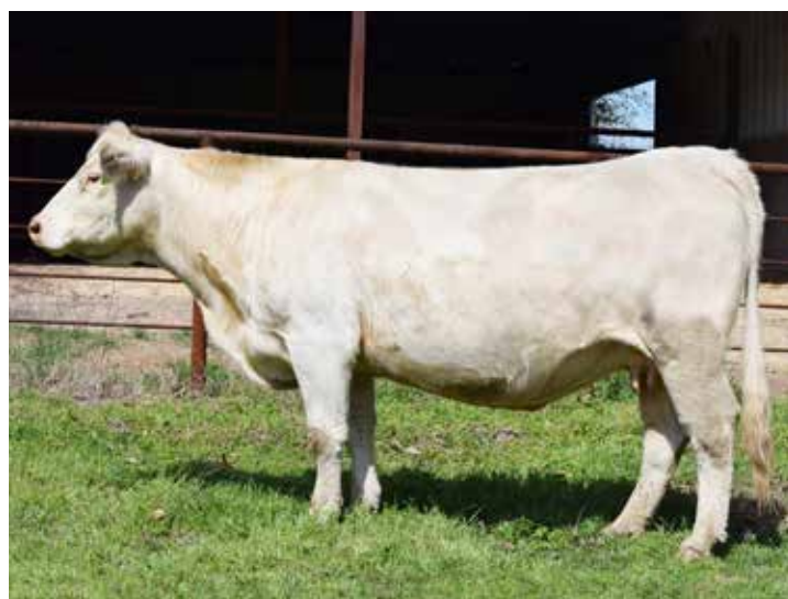
RE MS MAX DYNASTY 511 P ET SELLS AS LOT 35