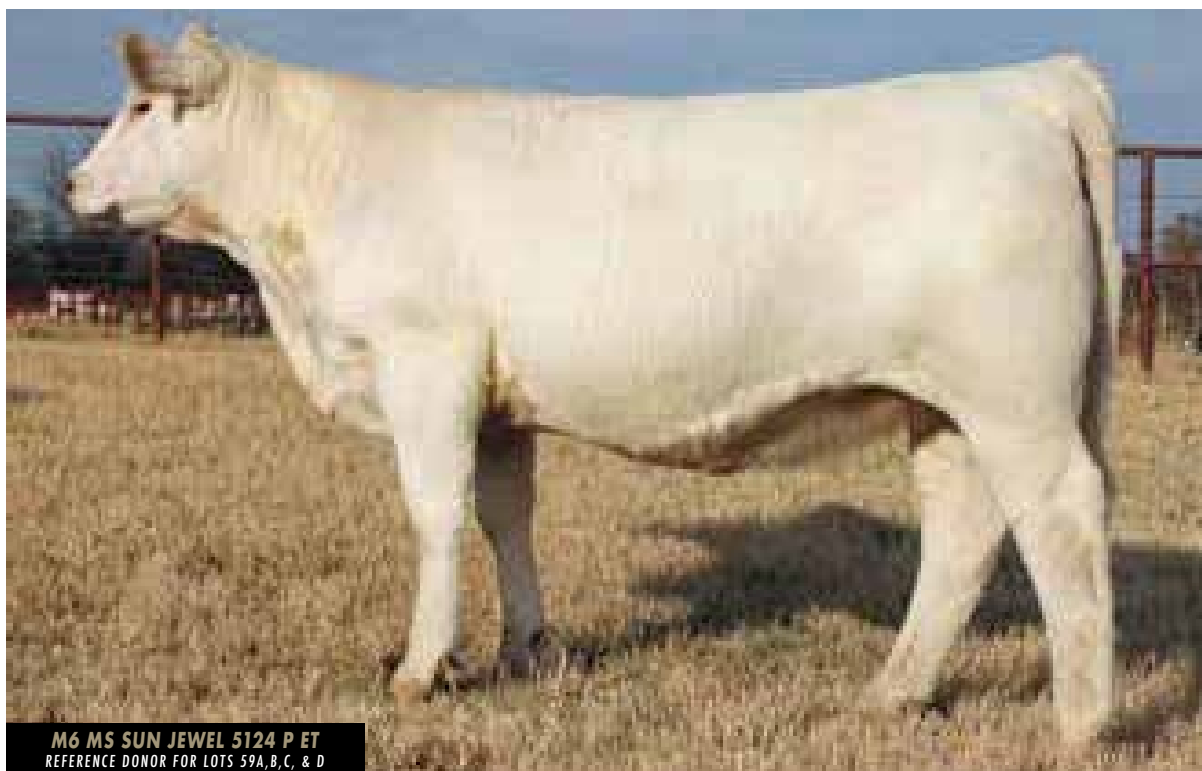
M6 MS SUN JEWEL 5124 P ET REFERENCE DONOR FOR LOTS 59A, B, C, & D