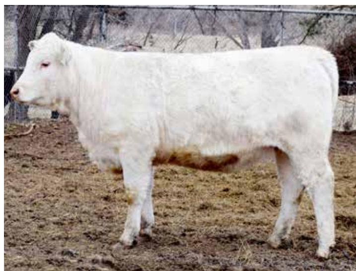
AFG CLARICE 2314 2214 PDC ET SELLS AS LOT 70

Sells bred A-I on 1/17/23 to DC/CRJ Tank E108, M905524, a calving ease bull with some of the best EPDs in the breed! 1314 ranks in the top 20% for CE, 15% Milk, and 20% MTL, 25%, strong Maternal traits! Blend with Tank's top 10% CE, 20% BW, 3% YW, 2% Milk, 3% MTL, 1% CW, 35% REA, and 2% TSI and you have an explosive set of numbers along with a indisputable pedigree and conformation!