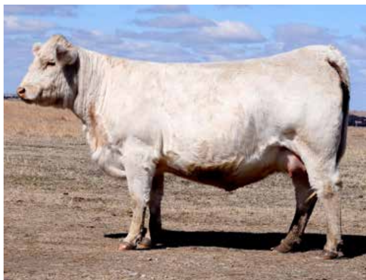
LCC MISS LADY 0464 7753 GS EF1307437 (PAF) TOP 1% CW, MARB. AND TSI 6% WW, 2% YW AND SC, 15% REA FOR EPDS