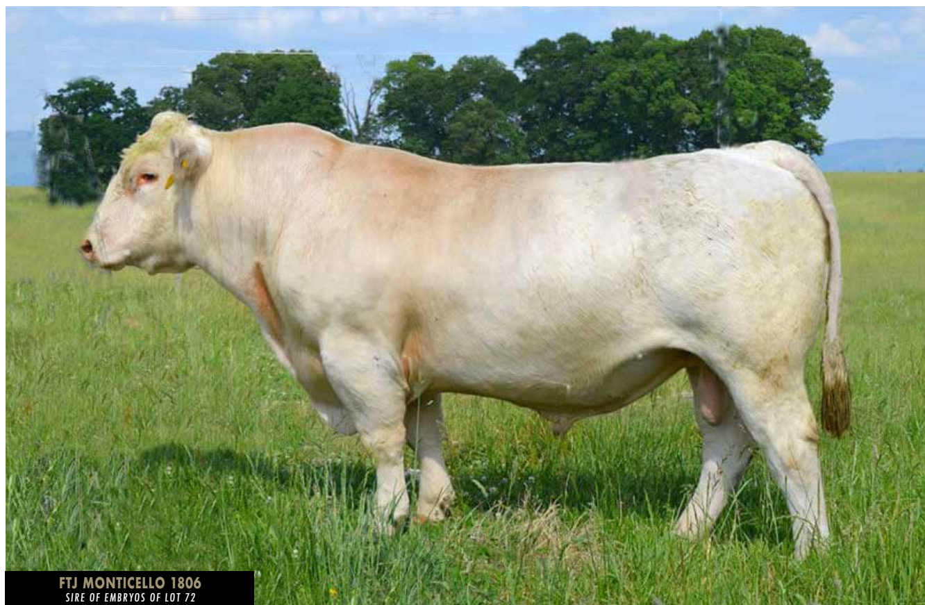
FTJ MONTICELLO 1806 SIRE OF EMBRYOS OF LOT 72