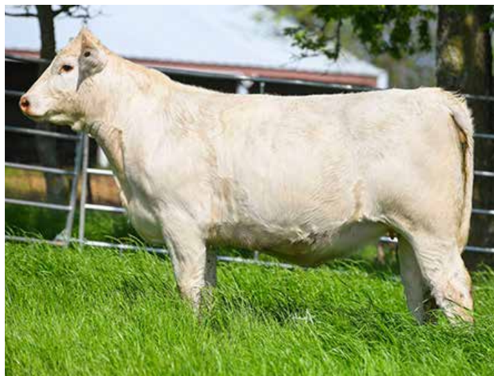
SC MS REWARD 860 P DAM OF LOT 53

Sells Open. Paternal sib to the high selling bulls at the 2023 Charolais for Profit bull sale! The pedigree on this heifer represents many foundation genetics. She traces to Endsleys Duke Stone 257, a former AICA Trait Leader, JWK Erma E216 that had an Impressive D040 daughter in Fink's program. RAF Cherry County 8500 was part of Circle K Antoinette's base. Blue Value is earning a great reputation for his daughters! She will work!