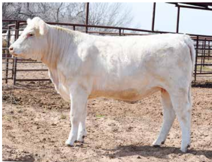
BARA 65Y LADY QUEEN 22J P SELLS AS LOT 12