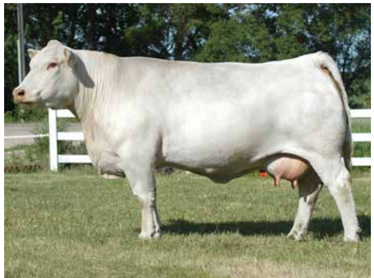
M6 MS E46'S DUKE 248 PET DAM OF DAM OF LOT 98

Sells Open. Solid balanced numbers, ranking in 30% for WW and YW, 35% MTL, 40% CW, 20% REA, and 35% TSI for breed comparisons. Notice the great donor of Southern Cattle and formerly Double-H, M6 Ms E46's Duke 248 P ET, 185 progenies with AICA, and Creek Cut Hope, 61 progenies, another prolific contributor to this stout pedigree. With the good Fargo influence on top you have a rock-solid base on this top young female!