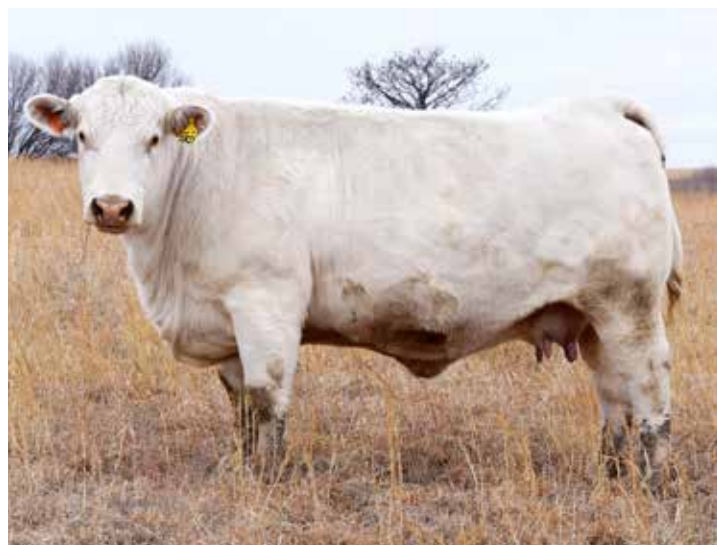
FINK LADY 9521 6815 GM SELLS AS LOT 74