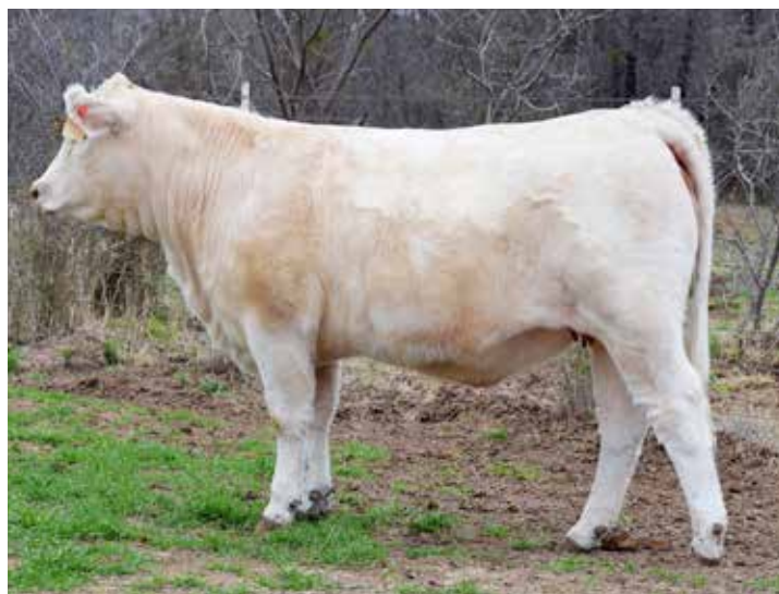
RE FIRST LADY CLARICE 202 ET SELLS AS LOT 32