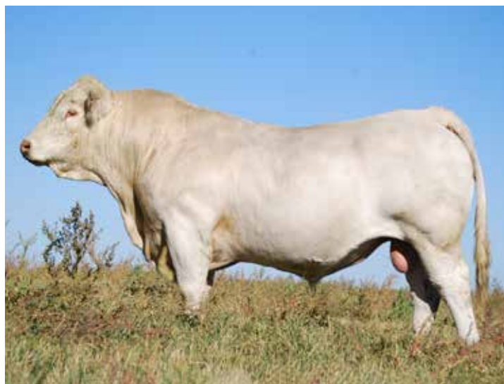
CJC MR PRESIDENT T122 SIRE OF LOT 7

7A: Pld heifer calf 22K, born 9/18/22, bw 71, sired by DC/CRJ Tank E108 P. Bred A-I on 1/6/23 to DC/CRJ Tank E108 P and PE from 3/1/23 to sale to RE Kingman 134 ET. This broody cow milks extremely well, is a big barreled, deep bodied cow. Her heifer calf was so good it made sense to breed her back to Tank to repeat the success. Dam is out of a Zen daughter and a full sib to President, the Commander 260. Zen females are the height of productive brood cows levels!