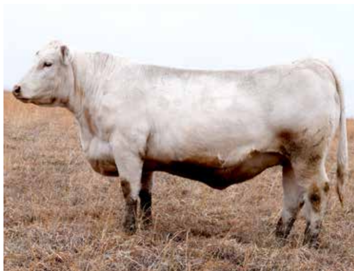
FINK LADY 001 6299 L&L SELLS AS LOT 77

Sells bred 1/17/23 to SCX Jehu 233E, the $245,000 sire! We flushed her one time and got 21 good embryos. A massive female, big boned, tremendous muscling, great disposition, and a brood cow femininity. Out of a tremendous Gold Standard cow, she ranks in the top 6% WW, 4% YW, 30% Milk, 15% MTL, 2% CW, 4% Marb, and 3% TSI for the breed. A proven flush cow in the prime of her life bred to one of the most exciting bulls in breed!