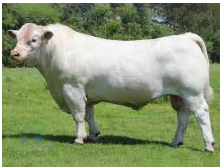
PLEASANT DAWN CHISUM 216A SIRE OF LOT 70