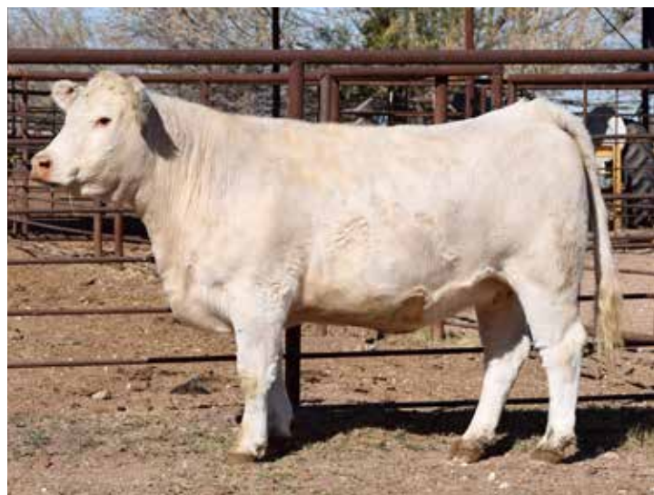
BARA MS 27E SANDY MAX 18H P SELLS AS LOT 4