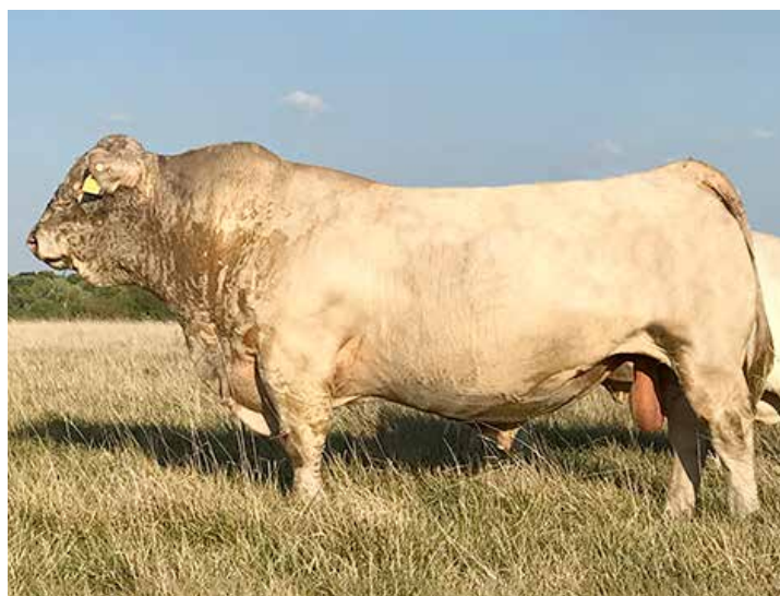
FINK GOLD STANDARD 0153 SIRE OF LOT 75

75A: Heifer calf born 3/22/23 sired by DC/CRJ Tank E108 P. She is a full sib to the $26,000 "Pick of Herd" in the 2022 Sale of Excellence. So many great ones to select from but this must be on your list at the top!! She ranks in the top 15% WW, 25% YW, 15% Milk, 8% MTL, 1% Udder, 2% Teat, 7% CW, 1% Marb, and 20% TSI for breed comparisons. If you want to see as uniform cows as there are, look at Fink's Gold Standard females, absolutely awesome!! Retaining one successful Flush.