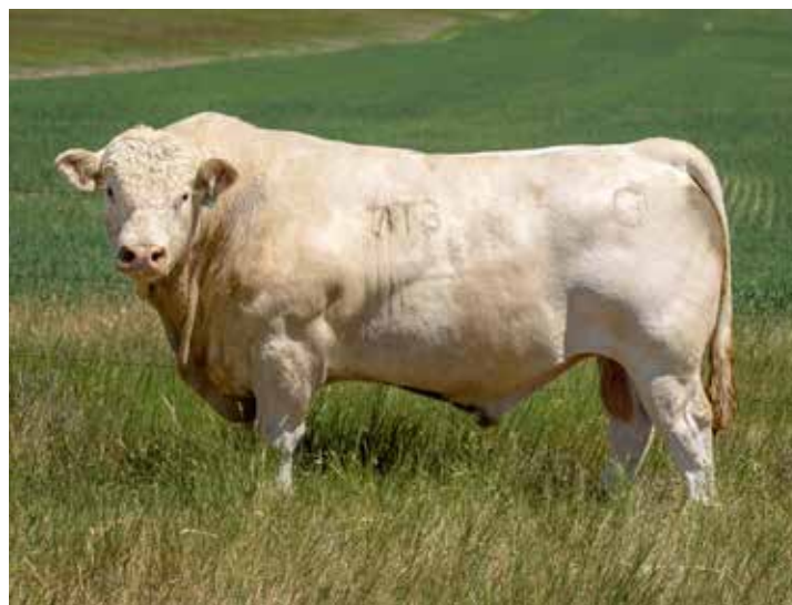
DC/CRJ TANK E108

SIRE OF LOT 1 M841630 HOMOZYGOUS POLLED PAF