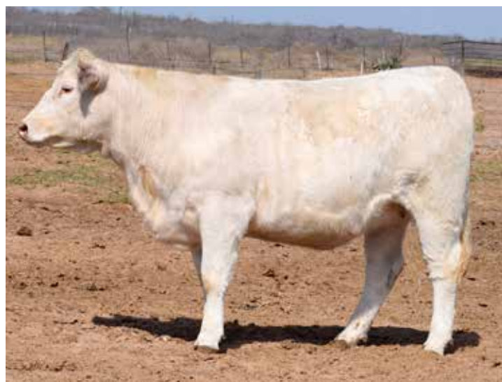
WC SUGAR LILI 131 SELLS AS LOT 14