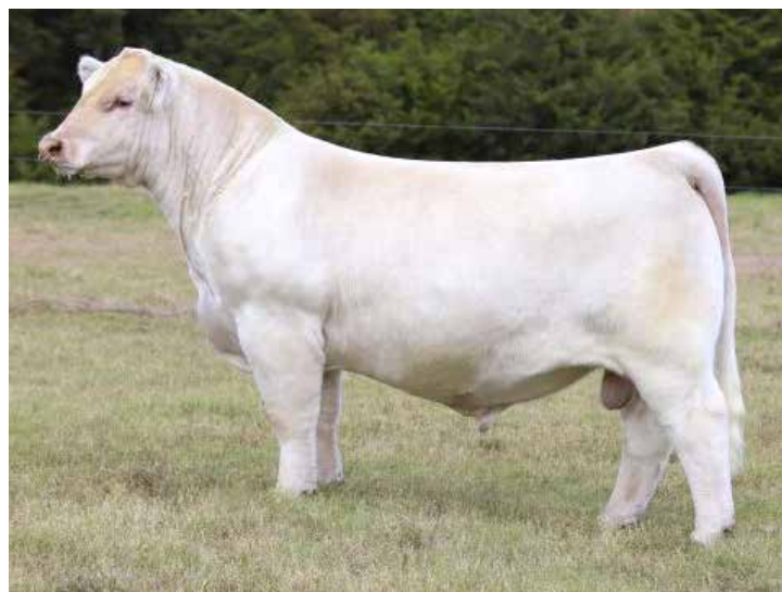
CCC WC REDEMPTION 7143 PLD ET SIRE OF LOT 52

51A: Selling 7-conventional embryos from mating Keystone H41 with Patricia Antoinette.