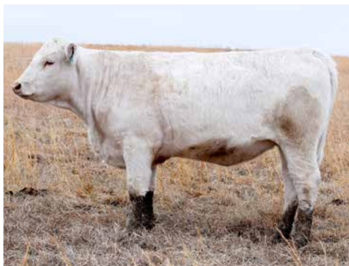
FINK MISS 1878 0380 L&L SELLS AS LOT 76

Sells bred 1/17, 23 to DC/CRJ Tank E108 P. Ranks in the top 2% for WW and YW, and top 1% for CW, Marb, and TSI EPDs for the breed. When you combine these numbers with Tank you will get some of the best numbers ever in the breed! Lock n Load has become one of the top bulls in the breed for carcass traits ranking in top 1% for CW, 15% REA, 7% Marb, and 3% TSI for comparisons. A well designed heifer, deep and long bodied, good bone, and big straight top, with perfect tail head setting!