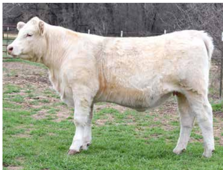
RE DUCHESS 205 SELLS AS LOT 26