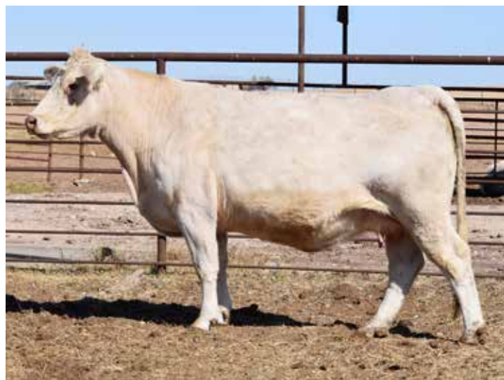
BARA MS MAX DUCHESS 33E P SELLS AS LOT 2