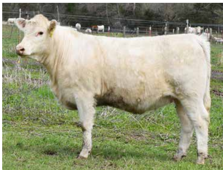
HF MS MANHATTAN KD12 SELLS AS LOT 50

Sells Open, with breeding privileges to any Hudspeth sire. Manhattan calves are tremendous and KD12 is an outstanding example of that quality! From her super feminine front end, long angular neck, moving to a big deep middle section, great spring of ribs, and a thick expressive hindquarter to complete a very eye-appealing package of broodcow! This unique New Zealand genetics adds a lot of excellent features!