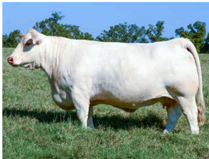
M6 MS NEW JEWEL 0155 PLD DONOR DAM OF LOT 79, 80 & 81 EMBRYOS