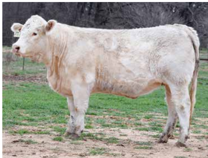
RE MS 12B BRAXTON 157 P ET SELLS AS LOT 23

Sells safe in calf from 12/31/22 A-I breeding to DC/CRJ Tank E108 P. This massive heifer displays the best of Cigar influence along with the elite blend of heavy milking Braxton genetics and super udder quality! When you talk about beef cows, this model certainly would qualify as an ideal of what a good broodcow should look like! Excellent growth numbers along with solid pedigree of Clarice 2809, Cigar, Braxton, and Tank genetics!