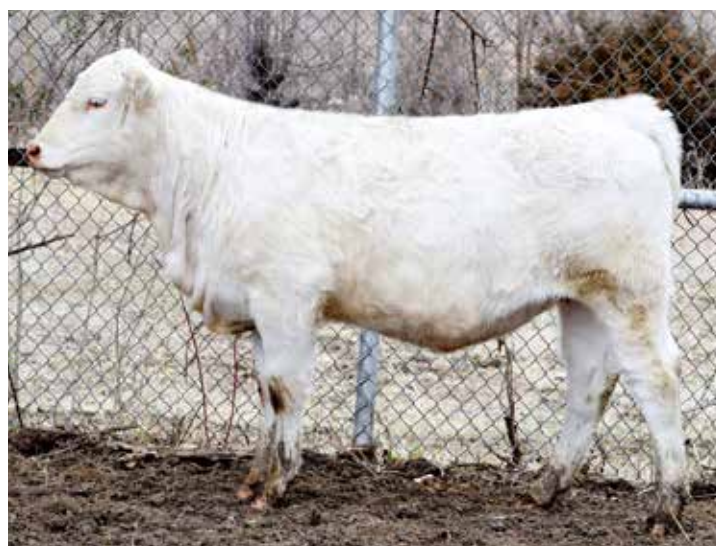
AFG NEW JEWEL 2355 0155 PM ET SELLS AS LOT 82

Sells Open, retaining 1-successful flush. Proof of the pudding when you see this daughter of Jewel 0155! Does she have the potential to bring over $20,000 some day? Certainly possible, with all the sister that have made major marks in the industry. These Powermax's show tremendous thickness and style. Jewel ranks in the top 15% WW, 20% YW, 6% Milk, 4% MTL, 20% CW, 4% REA, 35% Marb, and 20% TSI, very impressive in person!