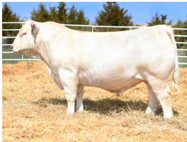
RBM KEYSTONE H41 SIRE OF LOT 51A EMBRYOS