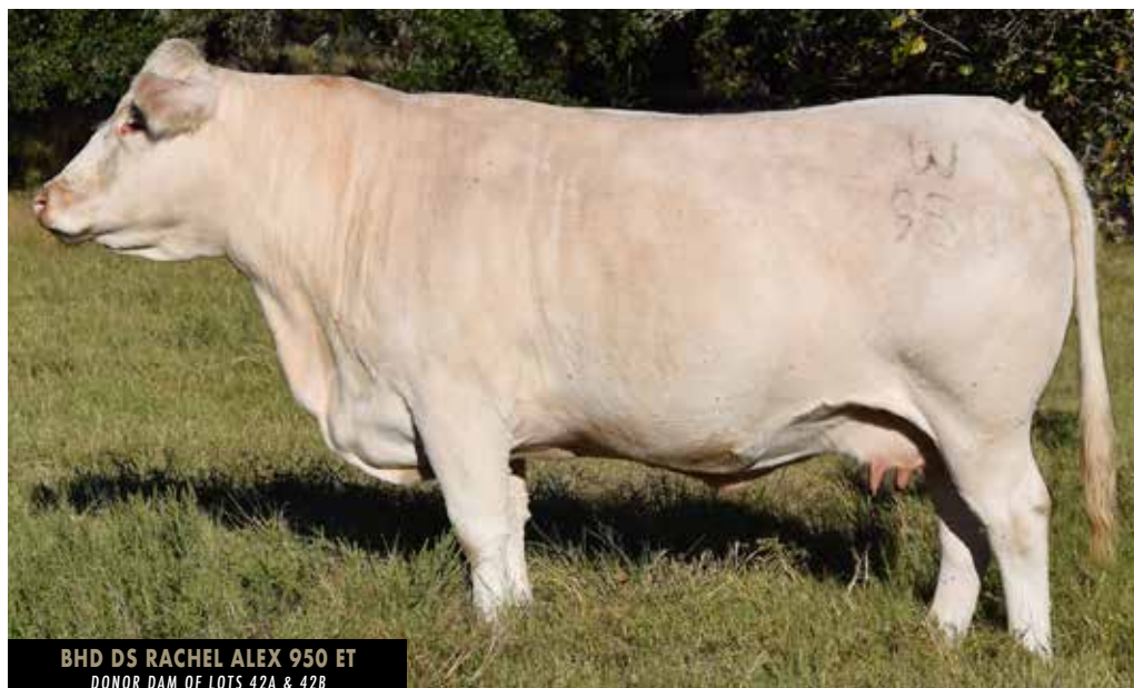
BHD DS RACHEL ALEX 950 ET DONOR DAM OF LOTS 42A & 42B