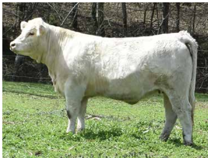
HF QUEEN J884 SELLS AS LOT 43

Selling a PB Pregnant Recipient with Embryo mating of LT Landmark 5052 Pld x BHD DS Rachel Alex 950 ET. Landmark is one of the easiest calving sires in the breed as evidenced by his top 3% ranking for CE and BW EDPs, also top 1% Milk, 8% MTL, and 15% REA for comparisons. This mating has created some moderate frame heifers with superb udder qualities and great maternal efforts. You won't be disappointed with the offspring from this super mating!