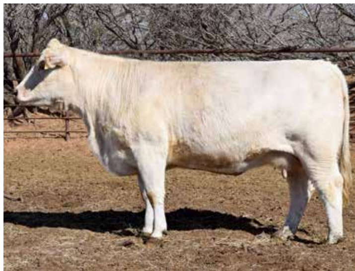
RE MS DUKE DYNASTY 960 SELLS AS LOT 6

Bred A-I on 1/6/23 to DC/CRJ Rooster H3118, PE from 3/1/23 to RE Kingman 134 ET to sale time. First Rooster calves have hit the ground and are outstanding. You will definitely hear more about this new potent sire! Another tremendous long-bodied, ultra feminine cow with solid pedigree. Her dam is a full sib to the M6 Ms E46's Duke 248 donor cow of Southern Cattle that was also in the Double H program.