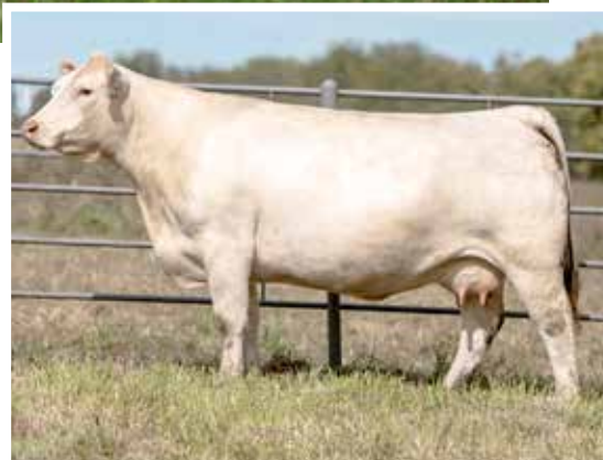
WC CLARICE 2214 P ET DONOR DAM OF LOT 67 EMBRYOS