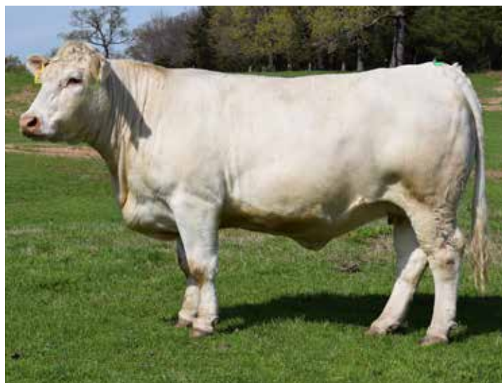
OHF SMOKING H816 ET DONOR DAM OF LOT 38 EMBRYOS

Selling 3-Conventional embryos from mating of JMAR Hosea 2M70 to OHF Smoking H816 ET. A special opportunity to jump forward with high quality embryos from some of the best genetics in the breed! With M6 New Standard you get one of the top EPDs bulls in the breed that has previously been the #1 EPD Trait bull! H816 represents an exceptional Cigar daughter from a solid background of the "Nancy" cow family in Three Trees Nancy 9126ET. Hosea owners are beaming with his offspring that appear to become some of the "best of the best!"