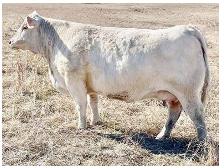
LCC MISS LADY 8857 6868 FL EF1275487 TOP 1% SC, UDDER, AND MARB. 2% TEAT, 4% CW AND TSI 35% WW, 10% YW FOR EPDS (PAF)