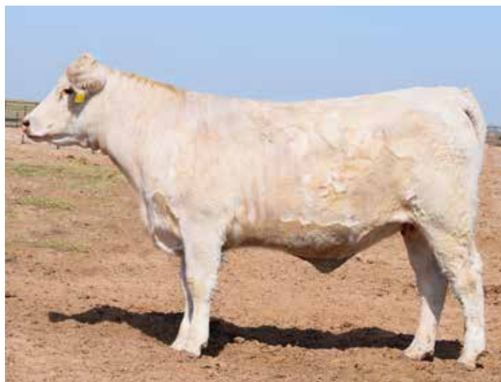
RE QUEEN 168 ET SELLS AS LOT 11