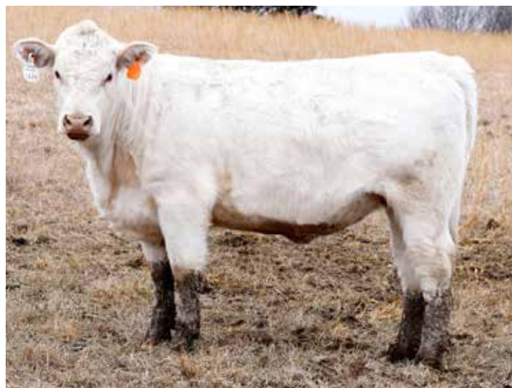
AFG CLARICE 1214 BRAXTON ET SELLS AS LOT 68