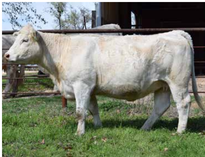
BAF CHROME INSIDER 615F SELLS AS LOT 37

Sells bred to A-I on 1/4/23 to JMAR Jubal 5P01 and DUE 10/16/23. Jubal is Homozygous Polled and PAF. A moderate frame cow with excellent milking ability and show winning background in pedigree. Her sire is one of 210 offspring of M&M Ms Carbine 1567, who is also the dam of M&M Outsider 4003. The dam side is one of Double H's solid breeding program tracing to M6 Ms E46's Duke 248 donor cow!