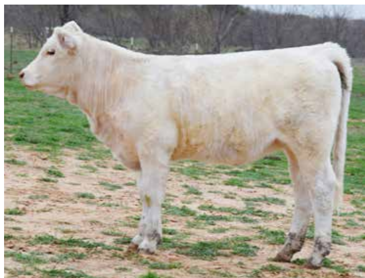
RE LADY SPUR 24 ET SELLS AS LOT 33