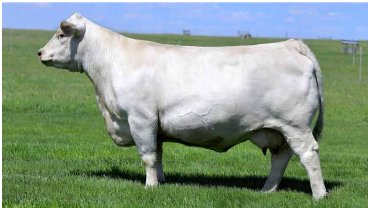
FINK MISS LADY 6362 019 FL

Fink Charolais is recognized as one of the most knowledgeable and successful seedstock producers in the industry! They have developed a program that benefits both commercial and purebred cattle producers to have the ability to make a profit! At their annual sales, bulls and females, are sold all over the U.S. One of the most enjoyable and challenging times you will have is making a selection due to the many fantastic choices and the great hospitality of the Fink's. They will be very happy to assist you in providing records and help in making a selection if you choose. This will be of the utmost in Donor cow material! You can't have breed leading genetics without owning the best in the Breed!