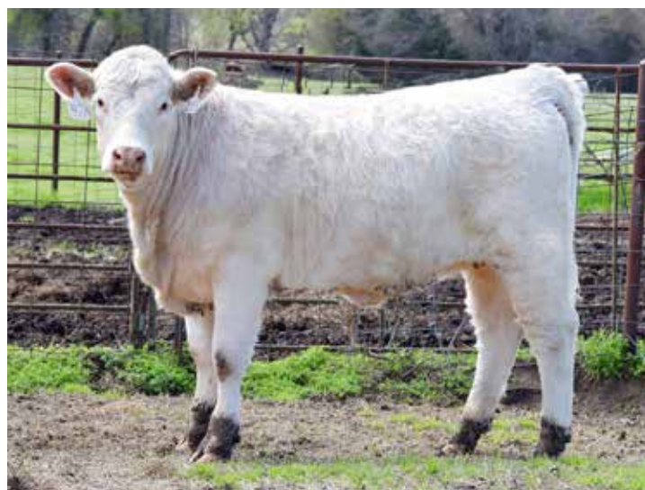
RDK MS ASHTON 213P SELLS AS LOT 40

39A: Pld heifer calf # K854, born 11/22/22, sired by RE Perfect Max 509, M941838. The Perfect Max calves are some of the thickest, stoutest calves you will find. Check this baby-doll out! Everlee is a moderate frame, heavy milking cow with perfect udder quality. She is out of the Ms Duke 34 lineage and the Ms Ali Mark E18 was the high selling cow in the first Sale of Excellence. Her son, L50 was a great calving ease sire out of Mac 809!