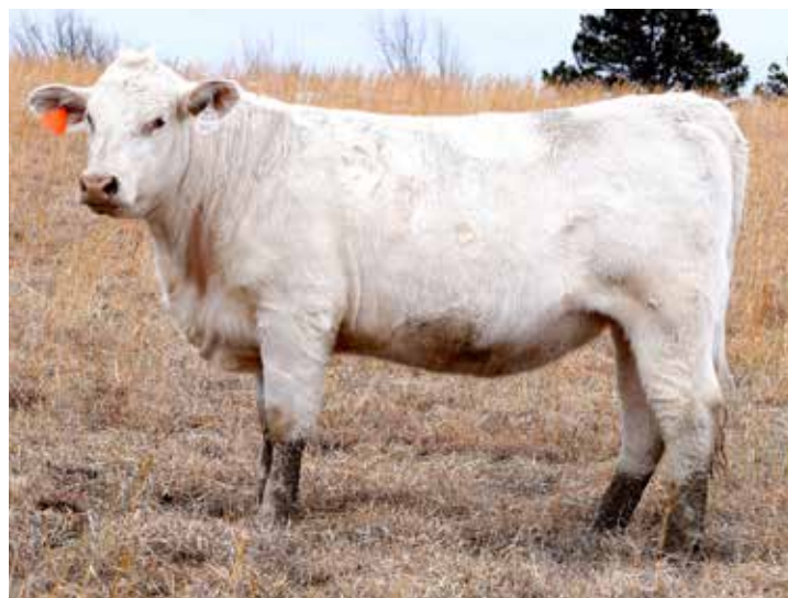
AFG CLARICE 1314 BRAXTON ET SELLS AS LOT 69

Sells bred A-I on 1/17/23 to DC/CRJ Tank E108 for calving ease and increased potential for rising to the next level. The Braxton females have tremendous udder quality, perfect teat placement, udder attachment, and teat size. They are making fantastic broodcows and with the maternal side of Clarice and even greater blend! The Tank calf should be an awesome individual with potential to pay for the whole package here!