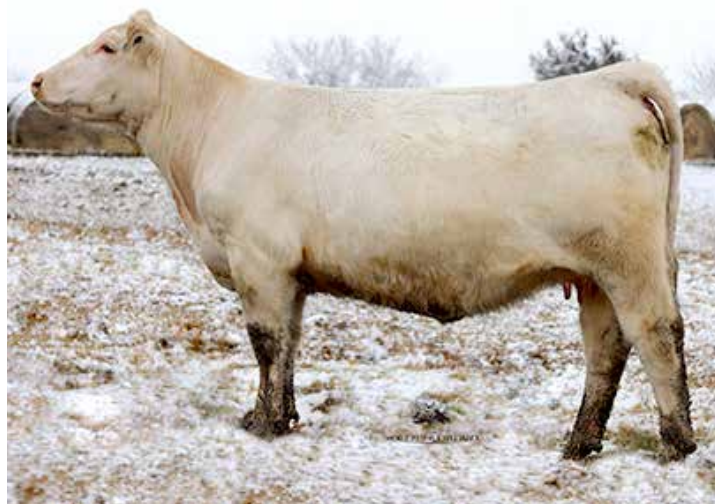
LCC MARION 3310 SELLS AS LOT 63

63A: Pld bull calf # 9302, born 11/4/22, bw 65, sired by DC/CRJ Tank E108 P. Sells Open. If you looked up femininity in the dictionary, a photo of this cow would be a perfect example! Beautiful udder structure, big square hip, plenty of volume, long-spined neck, and distinctive feminine front. Marion cow family is a well-known commodity around the winner's circle. Kingsman was the "Pick" of the 2018 Pen Bull Show in Denver for Wagonhammer Ranch.