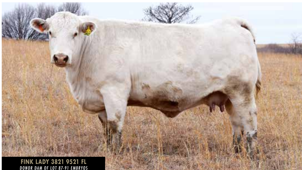
FINK LADY 3821 9521 FL DONOR DAM OF LOT 87-91 EMBRYOS