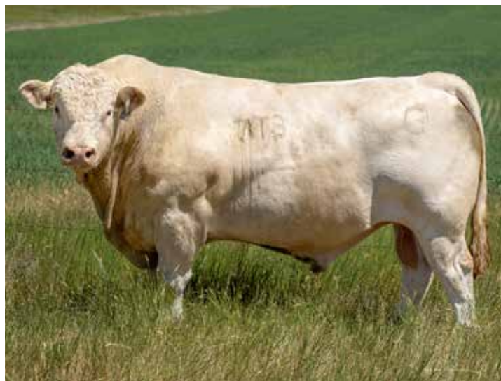
DC/CRJ TANK E108 P SIRE OF LOT 91 EMBRYOS

Selling 3-IVF Embryos from mating of M6 New Standard 842 P ET (PAF) x Fink Lady 3821 9521 FL. The magic that has worked so well for Fink has been to mate New Standard with his Free Lunch daughters and vice-versa. This combination has worked with precision for their breeding program. Two of the great Marbling sired have enabled them to have the highest rated cows in the breed for Marbling.