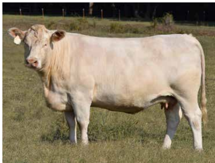
HF EVERLEE E854 SELLS AS LOT 39