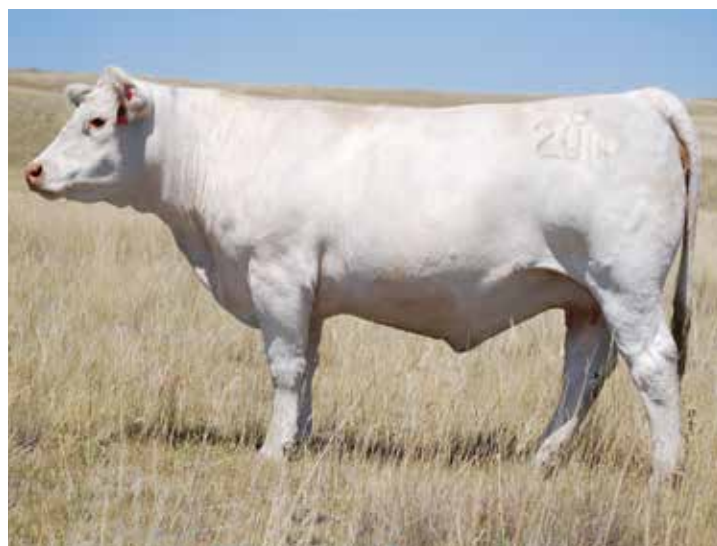
JDJ MS CIGAR B2011P ET DAM OF LOT 27