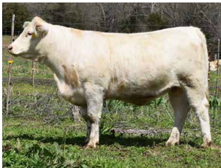
HF TIK K15B TW SELLS AS LOT 48

Sells Open. Twin heifer to lot 49, sired by the HF Ricochet G13C bull, a JDJ Smokester J1377 P ET son that we have used, and calves are showing tremendous potential. If all twins looked like these two, everyone would want twins! Just as powerful in design as any heifer in the sale, loaded with overall volume, thickness, and size! Breeding privileges to any Hudspeth sire, Pegasus, King, or Rooster!