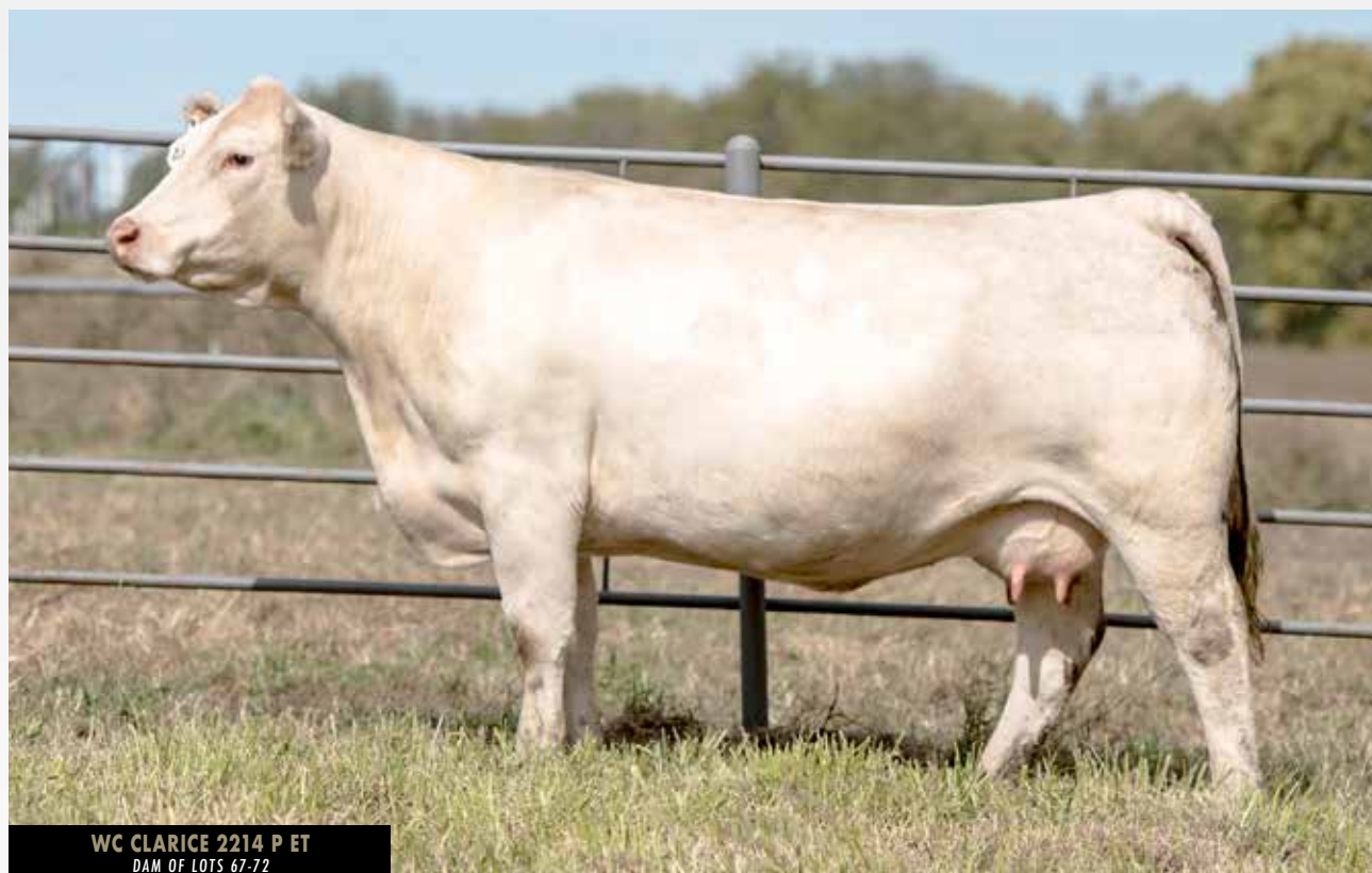
WC CLARICE 2214 P ET DAM OF LOTS 67-72