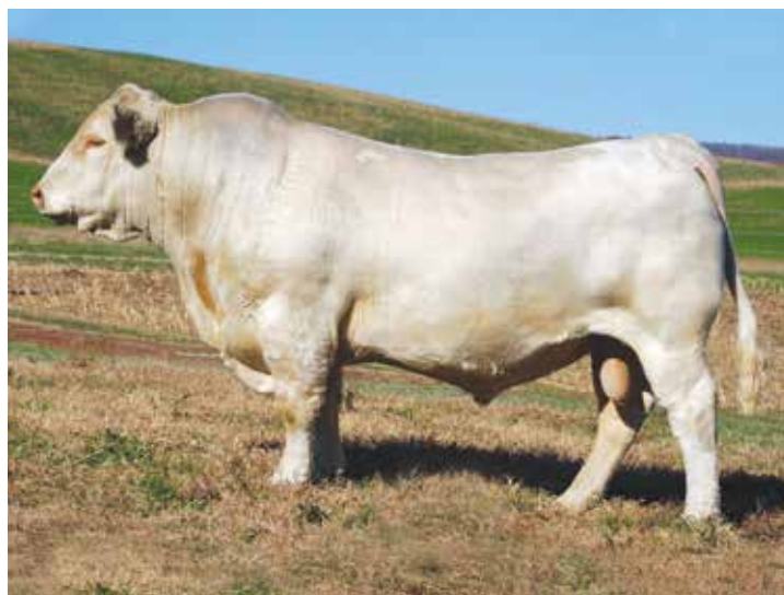
VPI FREE LUNCH 708T