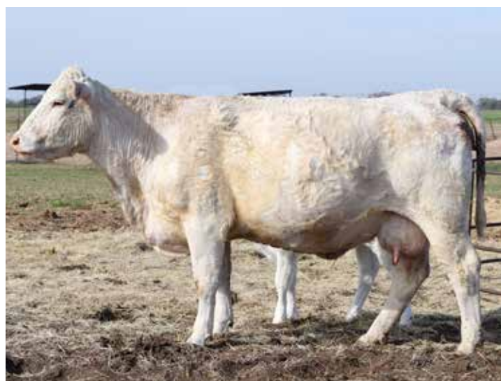
RCR UNO DUNK G611 SELLS AS LOT 16

A-I bred on 1/6/23 to DC/CRJ Tank E108 P, PE from 2/12/23 to RE Kingman 134 ET. The Arlitt's are well known for raising big, stout powerful females that retain good maternal ability. Amazing how much this heifer resembles the other great Arlitt consignments of Maximo's and King's in the sale. Lots of proven show winners in the pedigree of this big fancy lady! Another great TANK opportunity from a Tank!