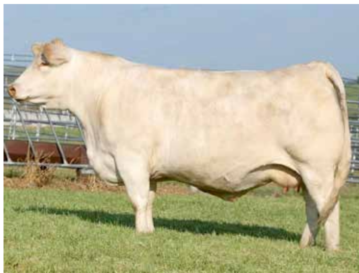
LCC MISS LADY 8008 GS EF1265940 TOP 1% WW, YW, UDDER, TEAT, CW, AND TSI FOR EPDS TOP 4% MTL AND MARB. 25% REA, 2% SC