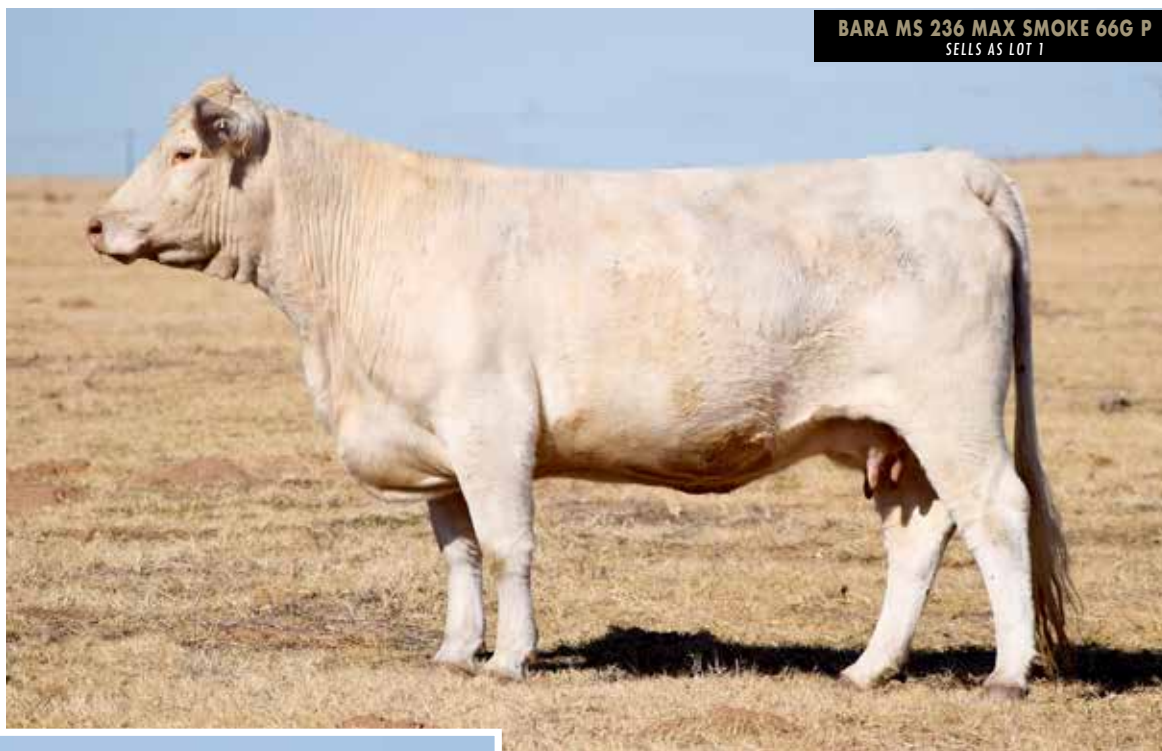
BARA MS 236 MAX SMOKE 66G P SELLS AS LOT 1