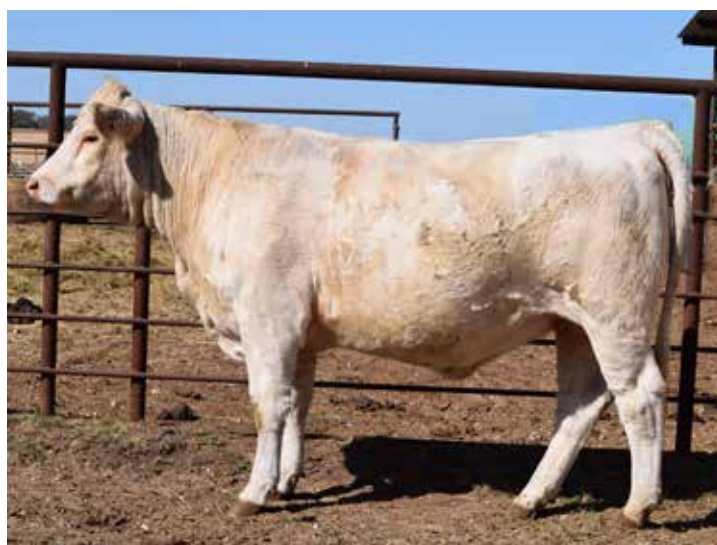
BARA MS B226 QUEEN OAKS 35H P SELLS AS LOT 10

9A: Pld heifer calf # 4L, born 3/5/23, bw 75, sired by JBC Smokester 816. Semen on any Arlitt sires furnished for rebreeding. Full sister to Lot 8, an excellent opportunity to add like genetics for more uniformity and a solid breeding program to your herd as several B2011 daughters sell! The 816 bull was a great addition to the program, his bulls calves were extremely thick and powerful and his daughters have tremendous udder quality.