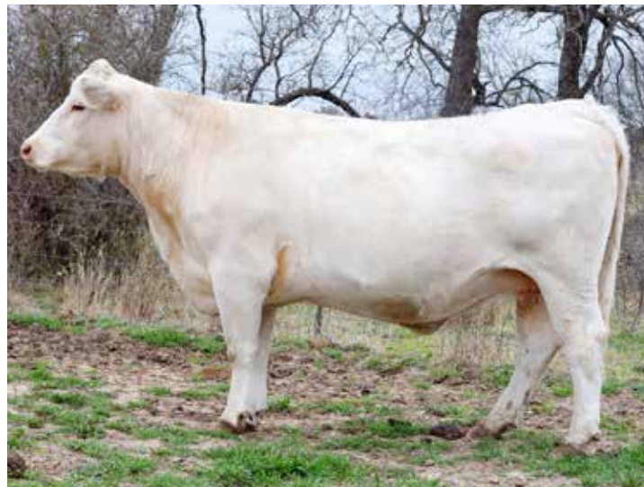
MV 2070 DUKE-GIGAR 412 SELLS AS LOT 25