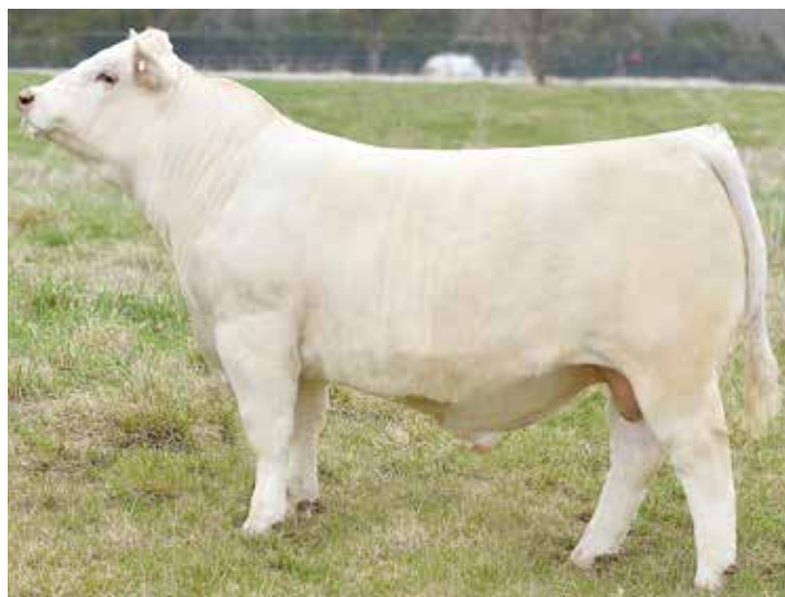
CCC WC RESOURCE 417 P SIRE OF LOT 54