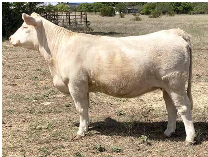
BAX PATRICIA ANTOINETTE SELLS AS LOT 51