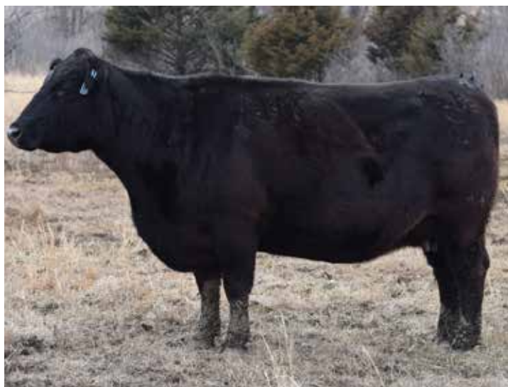
TYPICAL RECIPI USED IN ARISTO FARMS PROGRAM