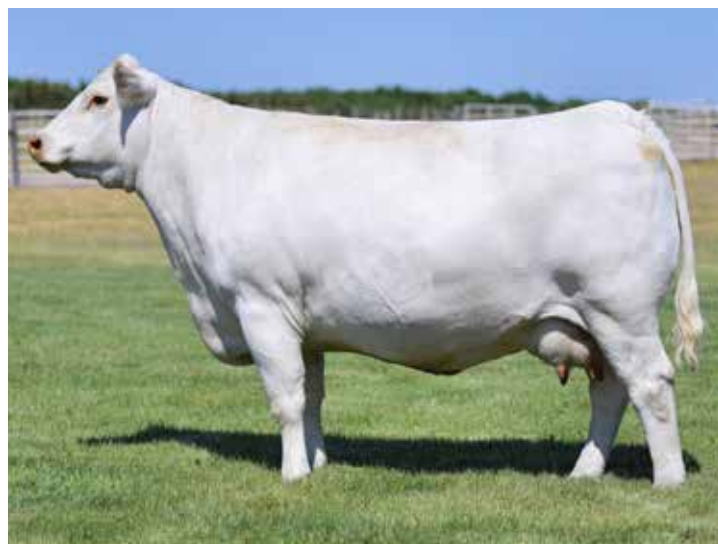
FINK MISS LADY 653 023 GS DONOR DAM OF LOT 93 EMBRYO