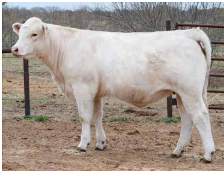
RE QUEEN 211 SELLS AS LOT 31

Sells Open. The trifecta of Tank x 116 in this sale. A great opportunity to develop a herd of high-quality heifers, these being full sisters, along with several other Tank daughters in the sale. What if you purchased all the Tanks here? What a powerful option to own that many outstanding females and be known for the #1 Tank herd in the U.S. You automatically have a breeding program that only requires selecting the right bull to use on them!