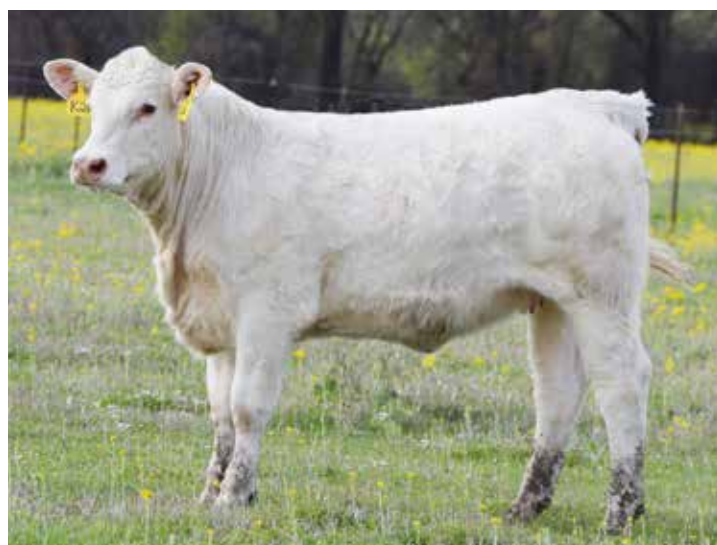
HEH MISS TEX ASSET F26 SELLS AS LOT 41

Will be bred to DC/CRJ Rooster H3118, M967107, Homozygous Polled, PAF. Very attractive heifer in design and structure. Good growth and performance add to her value. Her sire is a feature of Keabey herd, AL., and a very successful sire in his annual bull sale. Cool Rep is recognized as one of the top performing sires in the breed. Rooster was the 2nd high selling bull in the 2022 DeBruycker bull sale, sired by the Shark bull, one of the best!