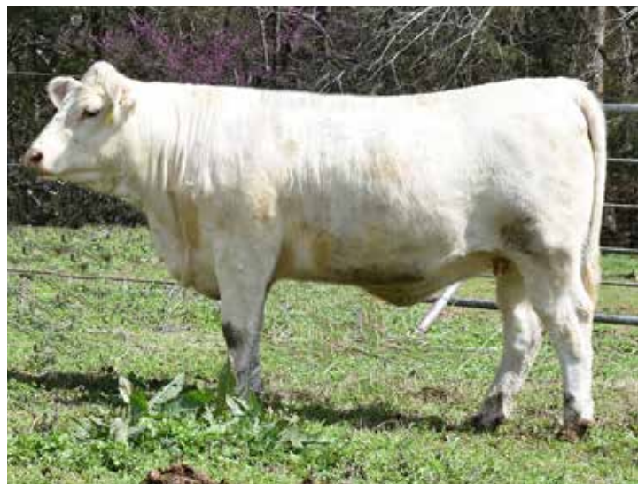
HF QUEEN JE307 SELLS AS LOT 45