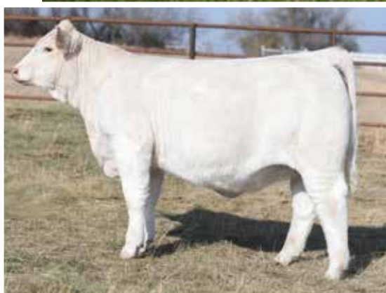
SOS DESIRAE PLD 141J DONOR DAM OF LOT 66 EMBRYOS