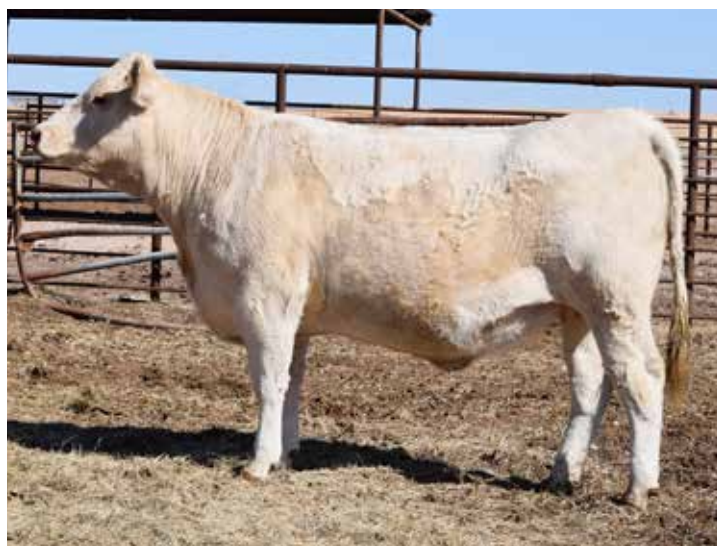
BARA B2011 LADY PRES 43H P ET SELLS AS LOT 8