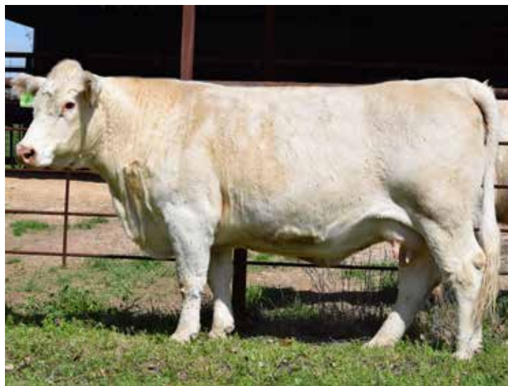
RE EQUAL DYNASTY 418 ET SELLS AS LOT 36

36A: Pld heifer calf # 418L, born 2/16/23, bw 74, sired by JMAR Jubal 5P01, M953191, the Pleasant Dawn Chisum 216A son out of a Free Lunch cow. (top 6% Marb and 2% TSI) Another great opportunity as 418 is also out of JDJ Ms Dynasty 428. This cow is a big volume cow, super udder quality, strong top line, good bone, and big hiped. Extra feminine but the power of a beef cow and great disposition. This fancy Jubal heifer represents the new Dynasty!