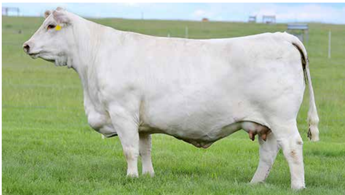
FINK MISS LADY 8007 4294 GS

$16,000 HIGH SELLING LOT IN THE 2021 SALE OF EXCELLENCE TO ANKONY CHAROLAIS, GA.