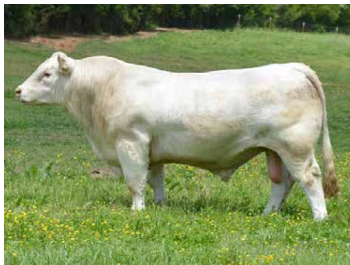
JDJ MAXIMO A18 P

1A: Pld heifer calf, 22K, born 9/18/22, bw 75, sired by DC/CRJ Tank E108 P. Bred A-I on 1/27/23 to DC/CRJ Rooster H3118, M967107, the 2nd high selling bull in the 2022 DeBruycker Bull sale at $20,000. (Sired by Shark F1366) PE from 3/1/23 to sale to RE Kingman 134 ET, EM975878 PAF. Super sharp and powerful heifer calf at side that displays plenty of volume, growth, and femininity! Dam ranks in top 15% for Milk and REA, two of the best indicators for profitability!