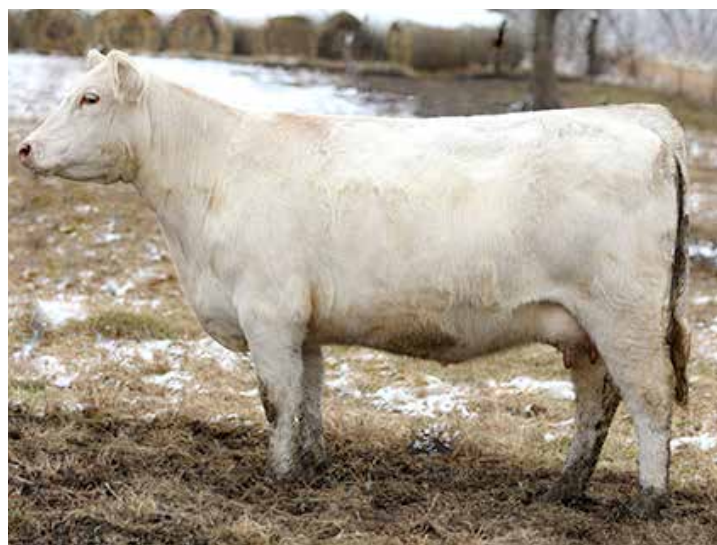
LCC TEXAS JEWEL 1580 SELLS AS LOT 61