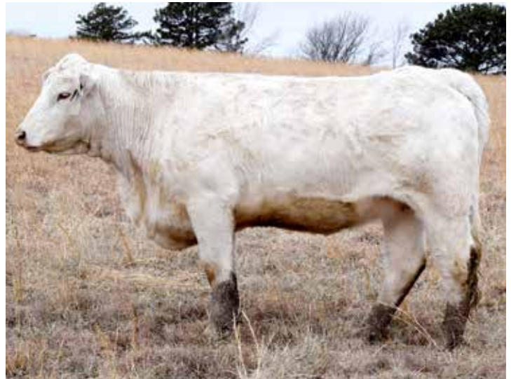
SOS ESTHER 218J SELLS AS LOT 97

Sells bred A-I on 2/26/23 to the great DC/CRJ Tank E108 P (PAF). This outstanding young female also hails from Canada as does the SOS Desirae 141J in lots 66A&B. They were both bred by Springside Farms, Airdrie, AB. This heifer displays tremendous bone, length, and stylish lines. Her Canadian EPDs rank her in the top 10% WW, 5% YW, 20% CW and REA, 10% Marb, and 20% LY. An outcross to mix perfectly with Tank!