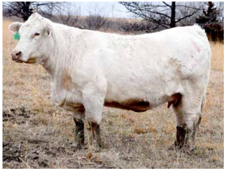
RE CIGAR DYNASTY 864 SELLS AS LOT 96

Sells bred A-I on 2/17/23 to SCX Jehu 233E (PAF). Her sire, 510 is a tremendous sire, his daughters have beautiful udders and excellent conformation with extra volume and muscling. His bull calves are loaded with muscling and sell easily! 510 is a son of Evans' great donor, JDJ Ms Dynasty L428. The dam traces to the LHD Ms Alger Y790, a full sister to several DeBruycker herdsires and a foundation line of great cattle including donor K258!