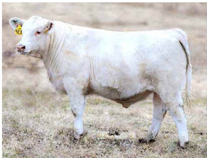
62A BULL CALF

62A: Powerful Pld bull calf, # 9232, bw 66, sired by DC/CRJ Tank E108 P, M905524. Bred A-I on 11/6/22 to CCC WC Resource 417 P. Tank has been one of the most popular and widely used bulls outside the showring. Has superb EPDs, top 10% CE, 20% BW, 3% YW, 2% Milk, 3% MTL, 1% CW, 35% REA, and 2% TSI rankings. This stout calf at side could easily be your next herdsire. He would be a sib to the $34,000 top selling bull in DeBruyckers' 2022 sale. But the cow is what produced this superb individual!