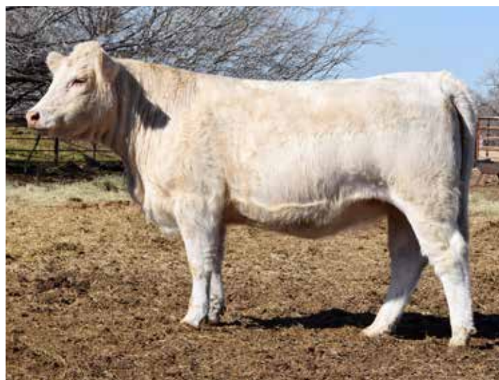
BARA MS SWEET LILY 33J P SELLS AS LOT 15

A-I bred on 1/6/23 to DC/CRJ Tank E108 P, PE from 2/12/23 to RE Kingman 134 ET. Superbly built heifer, deep ribbed, square hip and lots of thickness to replicate the true design of Sugar Daddy offspring! This is a BEEF cow while retaining plenty of femininity. Her Tank calf will be an awesome addition to any program! Her dam has an enviable CI of 6/17; twins 12/18; 3/20; 3/21; and 2/22 to show the fertility of Charolais!