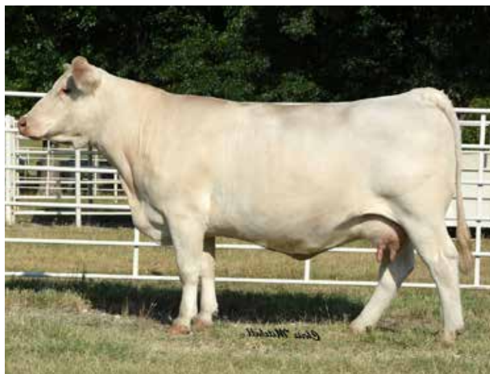
WELCOME GROVE ANN 1213 DAM OF LOT 19 EMBRYOS