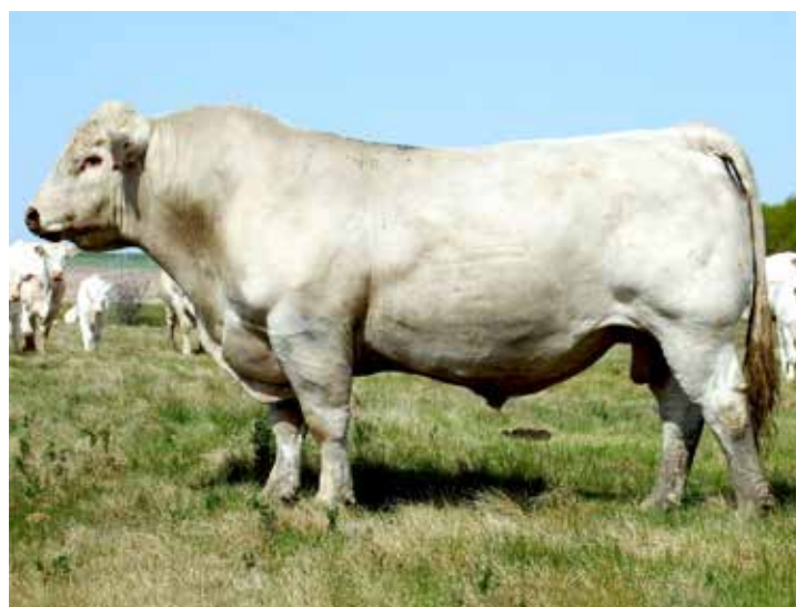
WCF MR SILVER GUN 467 SIRE OF LOT 88 & 89 EMBRYOS

Selling 3-IVF Embryos from mating of FTJ Monticello 1806 (PAF) x Fink Lady 3821 9521 FL. Some of the greatest marbling cattle in the breed are Fink bred cattle and by combining with Monticello you accentuate that factor. Monticello has also produced some of the top selling cattle in the breed, like the $31,000 JMAR Hosea 2M70 and JMAR Jefferson, the $48,000 addition to ABS genetics.