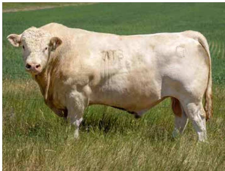
DC/CRJ TANK E108 P SIRE OF LOT 63 BULL CALF