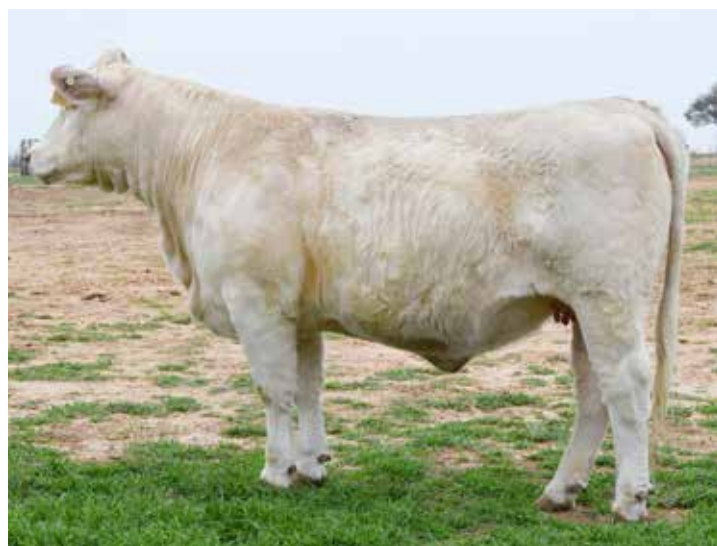
RE MS CORNERSTONE 521 SELLS AS LOT 34